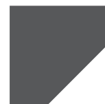
End Cap (E)